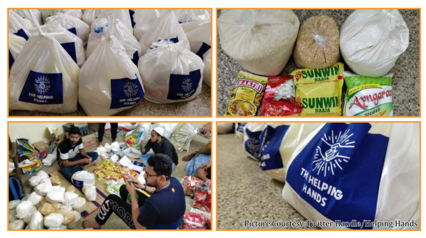
Helping Hands Foundation at work across various states. They launched a successful campaign Pledge your Eid to help the needy.

Residents of Matia Mahal also came together to feed two meals a day to needy. They feed the migrants and labourers in a small ground near Jama Masjid twice at 1 pm and 8 pm.