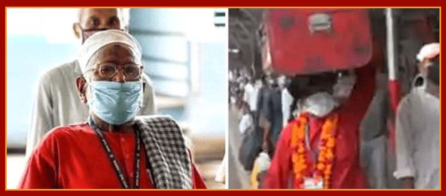
Abandoned by her son, a 70-year-old woman's last rites were conducted by Muslim activists at the Mangalgiri town in Guntur village.