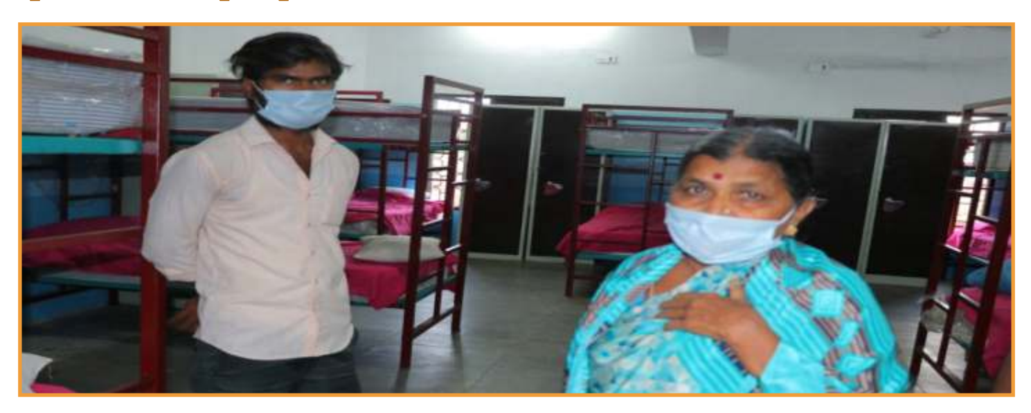
People at the quarantine centre offered by the Shaheen Group